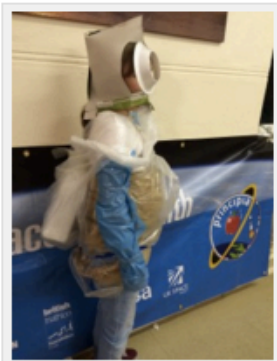
This EVA suit came complete with milk bottle oxygen tanks and air hose.