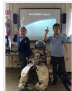
Rockets, Spacesuit and a Cosmic Hedgehog

The questions were endless! The enthusiasm of all ages when faced with such an amazing experience as being able to touch a real Spacesuit, really captures their imagination. I am so lucky